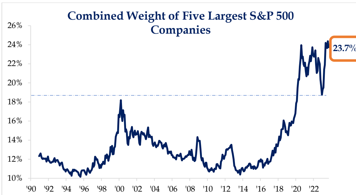
Figure #2: The Stock Market Remains Heavily Concentrated

broad market's returns for much of 2020 and 2021 (orange box). Of the five largest stocks, three pay no dividends.