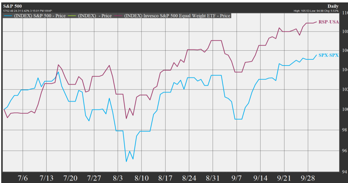
Figure #10: Equal-Weighted (RSP) vs. Cap-Weighted (SPX) S&P 500 Since July 1, 2024

This quarter, as Figure #10 shows, that trend has reversed and the red equal-weight S&P 500 RSP is back on top.