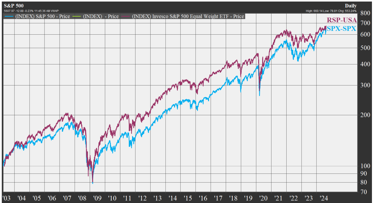
Figure #7: Equal-Weighted (RSP) vs. Cap-Weighted (SPX) S&P 500 Since April 2003

line, and the equal-weighted S&P 500, RSP the red line, since RSP's inception. For most of the past two decades, the equal-weighted S&P 500 has outperformed the cap-weighted S&P 500. So, when we have seen Ned Davis' Dividend Growers outpacing the Equal-Weighted S&P 500 in all these tables, the Dividend Growers have surpassed the tougher-to-beat index.